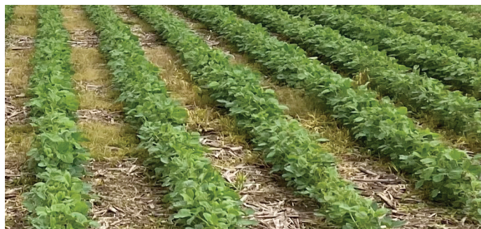
May 2025, Calloway County, KY