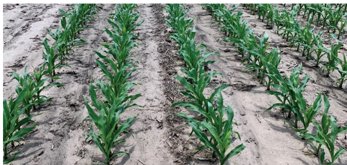
Aurora, NE in 2019, Seed+Dry, equivalent formulation to Seed+Graphite