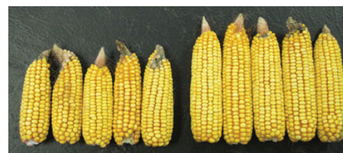
LEFT: untreated. RIGHT: NutriSphere-N pretreated.