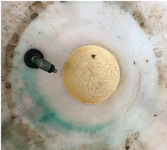
TRADITIONAL OPEN-AIR MIXING