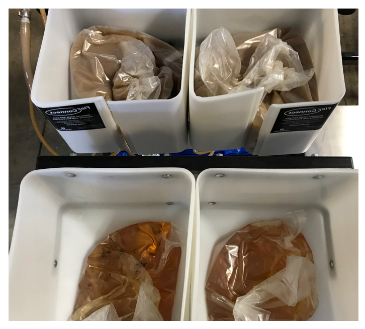
FLEXCONNECT CLOSED-LOOP DELIVERY

Open-air mixing introduces contamination to the inoculant, which immediately leads to a decrease in live rhizobium. Over a matter of hours, this contamination results in inoculant with near zero nitrogen-fixing capability. FlexConnect uses a closed system that delivers the maximum level of rhizobium to every seed, every time for up to 14 days after connecting the package to the system.